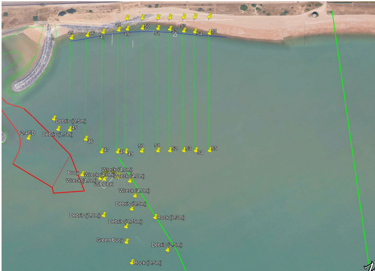
Figure 2 Delivery locations West of Sovereign harbour break water.

The delivery will take place from approximately 2 hours before high tide (HW) until 1 hour after each highwater.